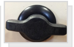
Standard Inner & Outer Door Stops